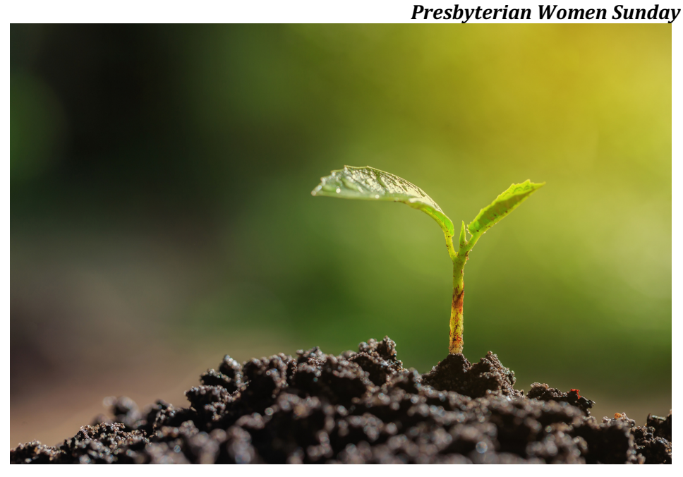
Let us prepare our hearts and minds for worship.