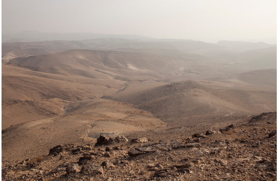
Let us prepare our hearts and minds for worship.