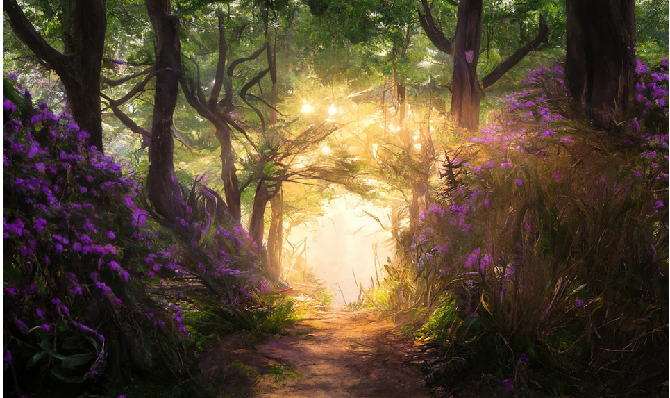
Let us prepare our hearts and minds for worship.

August 7, 2022 Sacrament of the Lord's Supper