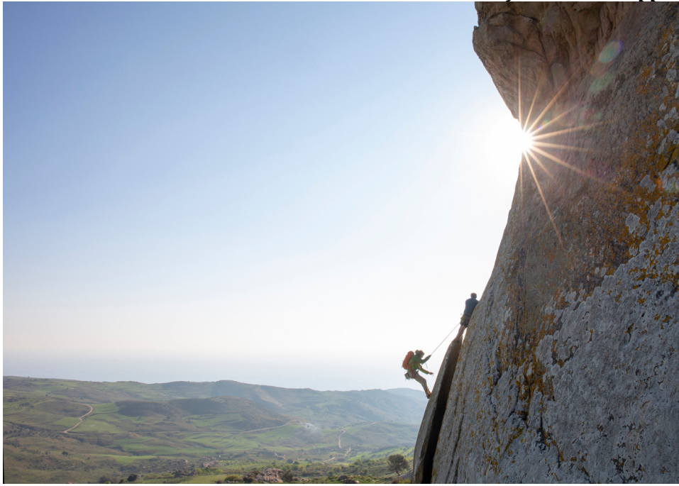
Let us prepare our hearts and minds for worship.

www.gcpcusa.org October 2, 2022 World Communion Sunday Sacrament of the Lord's Supper