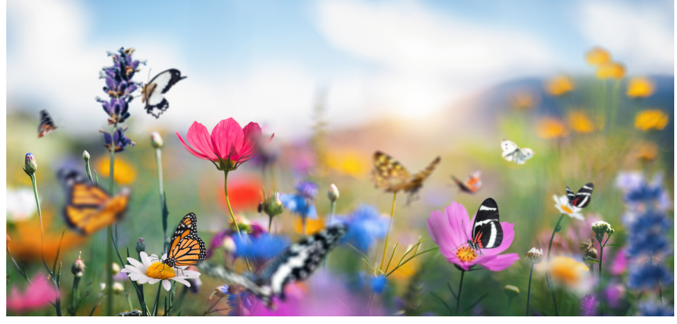
Your whole self is welcomed here. Please feel free to take care of your body during worship in ways that work for you.